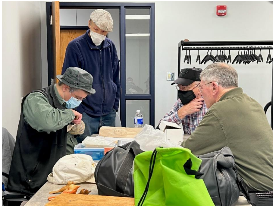
Rob face tutorial