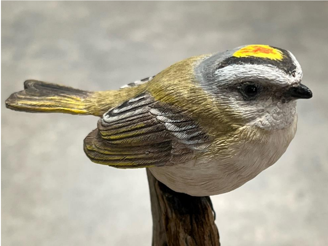
Al Adaskin kinglet